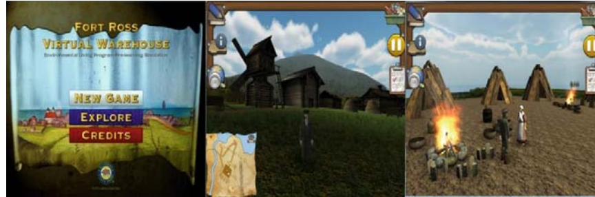
Fig. 4. Game menu screen (left); view of the Russian windmill and map feature (center); view of Vasilii interacting with a Native American NPC at the Kashaya village (right)