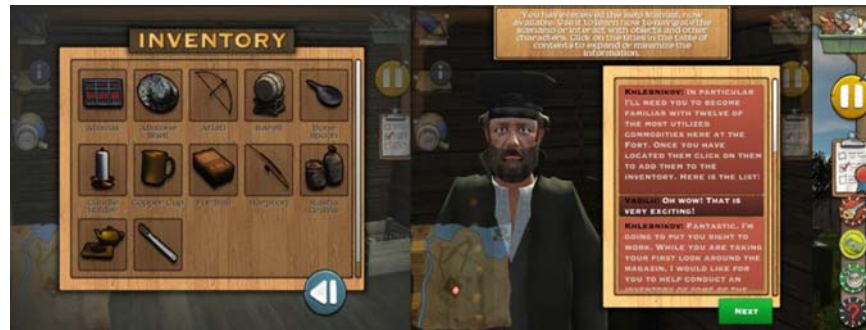
Fig. 5. Inventory screen (left), interaction with NPC and event notifier feature in CM (center); detail of the badge clipboard (right)