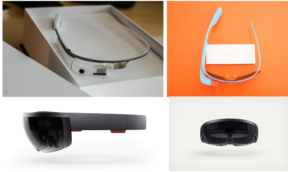
Figure 1. Top: Google Glass viewed in a box [54] and from above [41]. Bottom: Microsoft HoloLens viewed from the side and from the front [56]. Images CC-BY 2.0