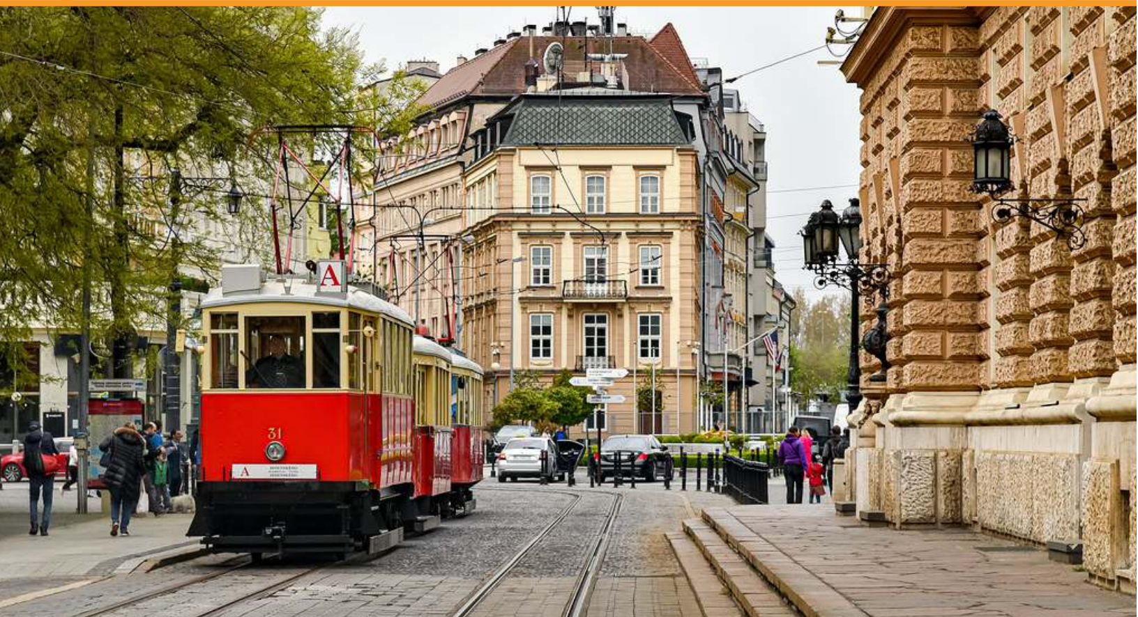
Bratislava