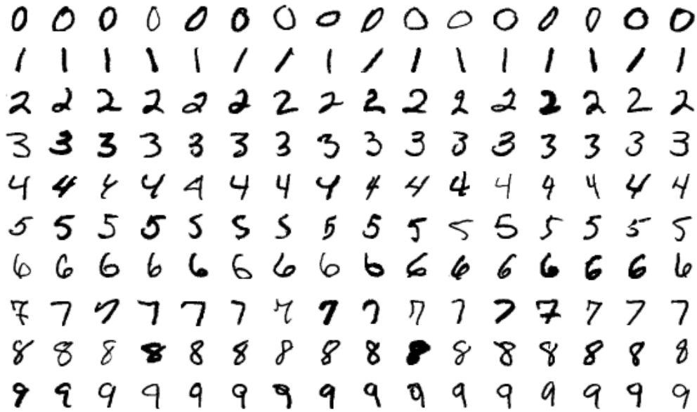
Figure 1: A sample of MNIST digits

American high school students. 9 The creators of MNIST reshuffled these two data sources and split them into training and test set. Moreover, they scaled and centered the digits. The exact procedure to derive MNIST from NIST was lost, but recently reconstructed by matching images from both data sources. 10