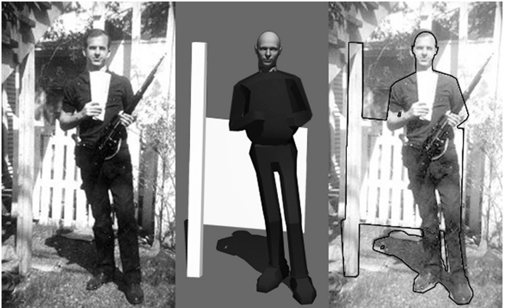
Figure 4. Oswald in his backyard (left), a 3-D reconstruction (middle), and a superposition of the reconstruction and the original (right)—the scene geometry and shadows are well matched.