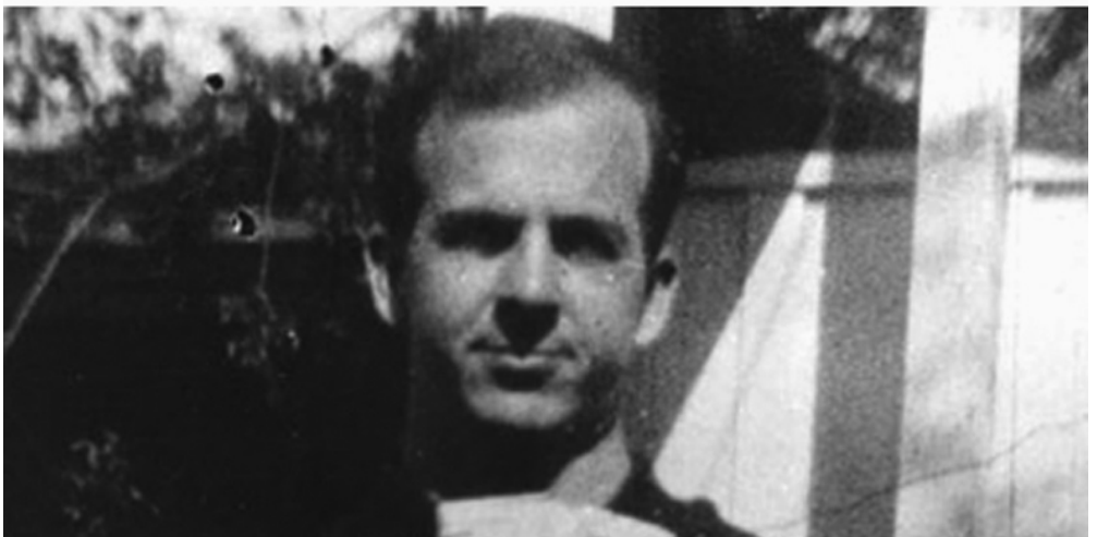
Figure 1. Lee Harvey Oswald in his backyard (top) and a magnified view of his head (bottom). Are the shadows in this photo inconsistent with a single light source?