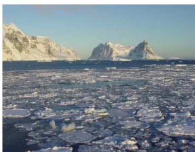
LeMaire Channel, Antarctic Peninsula

In a time of very abrupt climate change in the Arctic, areas of IPY study include a wide range of physical, biological, chemical and social research topics. The CCGG group has air samples being collected at four Antarctic sites and six to nine Arctic sites, depending on whether defining the Arctic based solely on being north of the Arctic Circle, or based on climate and ecology. These sites are located in Canada, Finland, Greenland, Iceland, Norway, the Norwegian Sea, and the United States. Although these sites are part of a long-term, ongoing monitoring program and are not funded by special IPY monies, the data from these samples will be studied as part of the larger IPY effort. As part of an official IPY project, NOAA is working with Russia's Roshydromet and the Finnish Meteorological Institute to set up a new observatory in Tiksi, Siberia. For further information about IPY, see www.ipy.org .