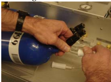
Figure 2: Correct