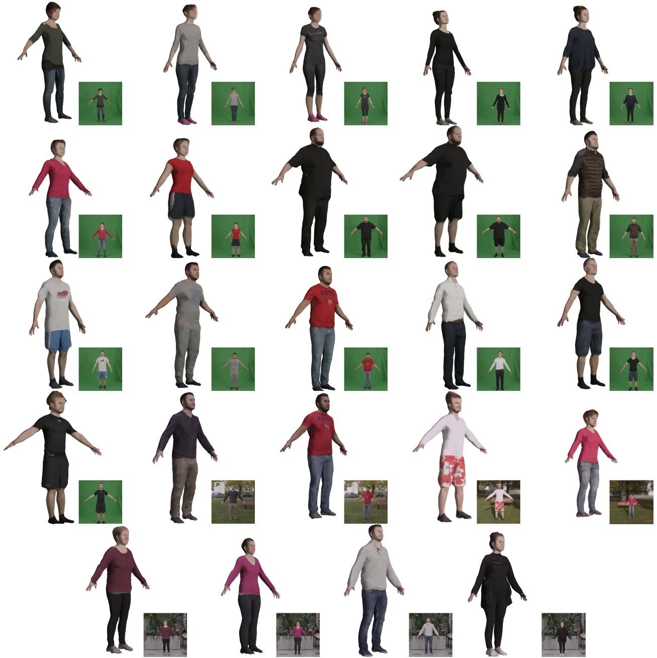
Figure 3. Results on our People-Snapshot dataset. We blurred the faces for the subjects that did not give consent.