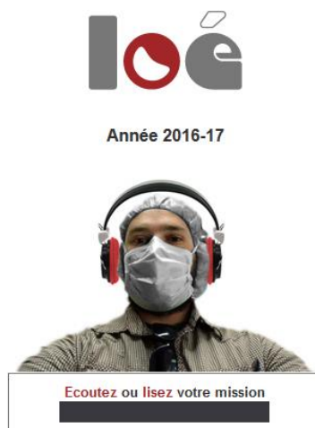
Figure 4. Laboratorium of Epidemiology

In addition, when it comes to training adults, who already have professional experience, games can turn out to be better suited than traditional training (Federation of American Scientist, 2006; Mayo, 2007). This can be explained by the fact that adults find it difficult to “go back to school” and accept criticism from a teacher, who is often younger than them. Learning Games offer an original, less academic way of learning. In addition, the games can be designed so that all forms of judgment come from the game and not the teacher. In Laboratorium of epidemiology 9 (Figure 4), the hospital’s chief doctor asks the students to write an essay. These essays are actually corrected by the teacher but, the fact that the comments are delivered by the chief doctor gives them more weight and eliminates remonstrance (Ney and Balacheff, 2008).