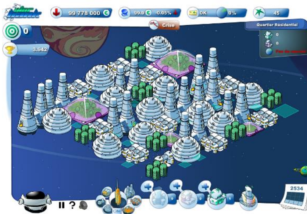
Figure 2. Starbank The Game (BNP Paribas), used to train bank employees

Learning Games have the power of involving students in their own learning process with game mechanics such as competition, rewards, social recognition — and many more — that enhance motivation and activate the students' capacities (Dondlinger, 2007). Learning Games offer much more than a simple simulation environment. They offer the possibility of creating role playing games based on complex scenarios with stories and quests. Thanks to these mechanics, learners can project themselves into a character and are emotionally engaged in the action of helping this character attain his/her goal. Throughout the game, the character will need to master various skills to fulfill his/her objectives. Many educational games offer such engaging scenarios. Starbank The Game 6 (Figure 2) for example is used to train new bank employees, Les aventures de Casey Warren 7 is used to train employees in data security.