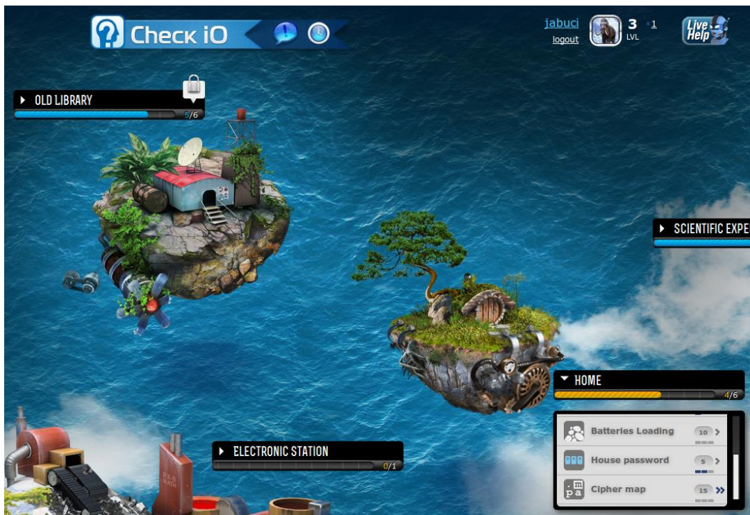
Figure 3. CheckiO used for teaching computer programming (source https://checkio.org/ )