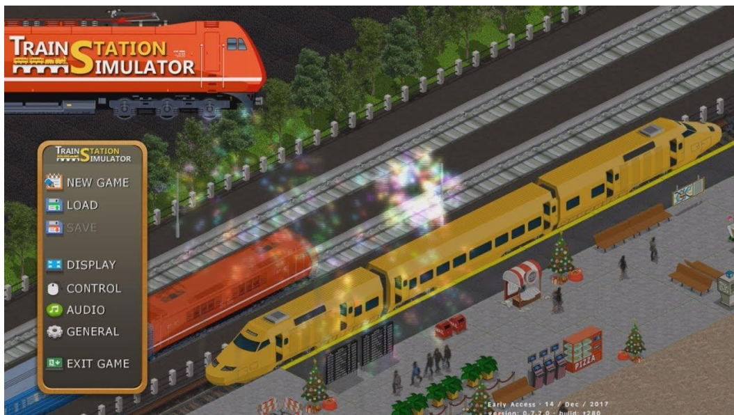
Figure 1. Train Simulator (Electronic Arts) used for training train drivers

Computer games have the advantage of offering adaptable virtual environments that are very useful for recreating specific situations and simulating the context in which learners will use their skills. This is particularly advantageous when the context is impossible or very difficult to reproduce because of its costly or dangerous nature. For example, The Resuscitation Game 4 is used to teach medical procedures and reanimation technics for neonatal resuscitation. Rail Simulator 5 (Figure 1) allows future train drivers to validate their management and driving skills. Virtual Reality is one of the latest advances in simulations. This technology immerses the learners in an interactive virtual world and allows them to practice their orientation and manipulation skills. Virtual reality is also used for simulating stressful situations in order to help learners control their emotions (Marfisi-Schottman et al., 2018; Ponder et al., 2003).