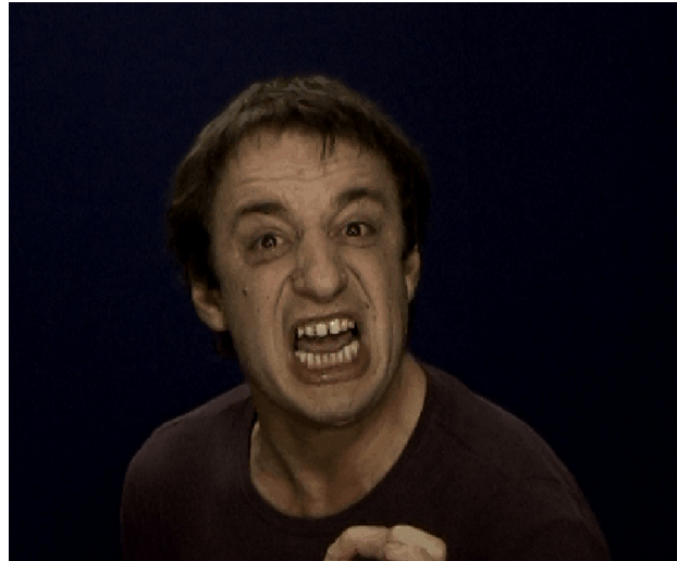
Fig. 1. An example of the GEMEP-FERA dataset: one of the actors displaying an expression associated with the emotion ‘anger’.

Another way existing systems can be classified is in the way they make use of temporal information. Some systems only use the temporal dynamics information encoded directly in the utilised features (e.g. [24], [69]), others only employ machine learning techniques to model time (e.g. [52], [58]), while others employ both (e.g. [59]). Currently it is unknown what approach could guarantee the best performance.