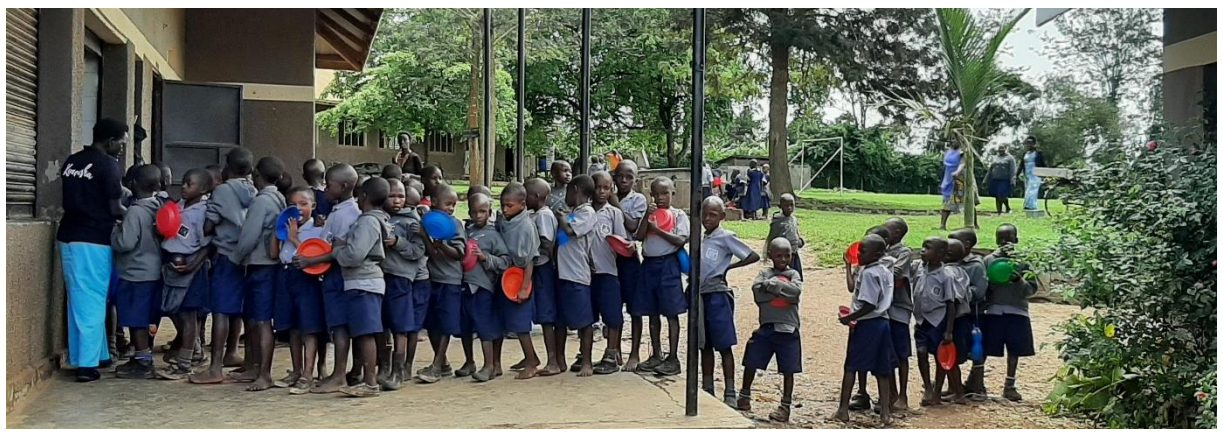
Some things don't change – the children are still queuing up for their lunch, also 30 years later

KCC has a handful of social workers who monitor the progress of the children regularly, but also stay in touch with their guardians. They know the home situations of each child and give additional supports to the homes that face challenges. The wall of the office for the two social workers working with the children doing their A-levels or university is covered with graduation pictures of the children that are now adults and have become medical doctors, teachers, a lawyer, businessmen and even a Member of Parliament. Education really can change lives and communities.