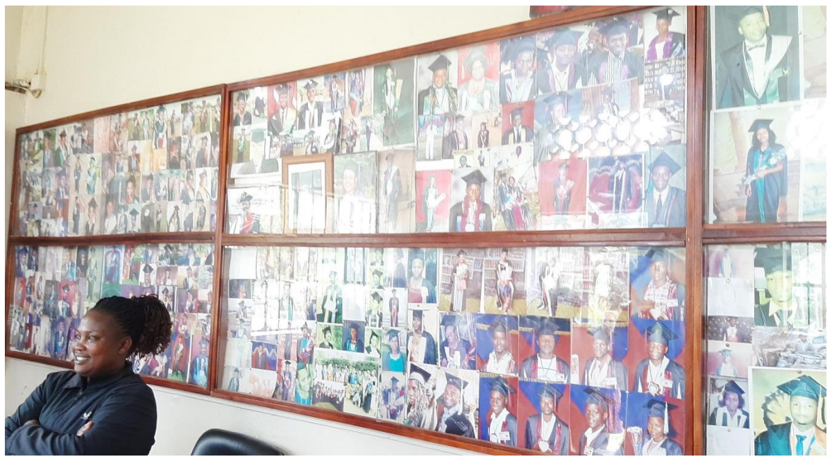
Kibaale's Wall of Fame: with over 150 graduates from Kibaale Children's Centre

KCC has a handful of social workers who monitor the progress of the children regularly, but also stay in touch with their guardians. They know the home situations of each child and give additional supports to the homes that face challenges. The wall of the office for the two social workers working with the children doing their A-levels or university is covered with graduation pictures of the children that are now adults and have become medical doctors, teachers, a lawyer, businessmen and even a Member of Parliament. Education really can change lives and communities.