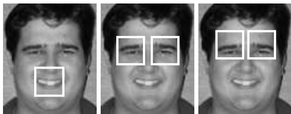
Figure 2. The local face regions of the mouth (left), eye (middle), and brow (right) regions from which features were selected for each AU classifier.

scaled such that the coordinates of the eyes and mouth were constant over all images. The face width was set to 64 pixels; the inter-ocular distance was set to 24 pixels; and the y-distance between the eyes and mouth was 26 pixels.