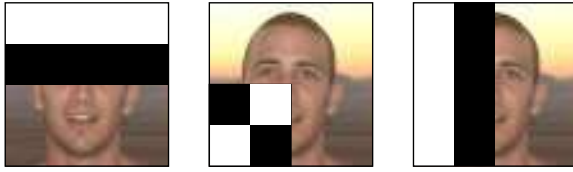
Figure 1. Examples of Haar wavelets in a true Haar decomposition superimposed onto a face image. Width, height, and (x,y) positions of all wavelets are aligned at powers of 2.

actly complete, i.e., the Haar decomposition of an image with n^2 pixels contains exactly n^2 coefficients. Each wavelet is constrained both in its (x,y) location and its width and height to be aligned on a power of 2. For object recognition systems, however, these constraints are sometimes relaxed in order to improve classification results. Papageorgiou, et al [9] modified the wavelet decomposition so that the wavelet basis is shifted at 4 times the normal density of the conventional Haar transform. The resulting set of “quadruple-density” Haar coefficients allows object recognition at a finer resolution than would be possible using the standard approach. Viola and Jones in [11] constructed a face detector by using a modified version of the true Haar decomposition which includes a new “Haar” wavelet containing three subregions (instead of 1, 2, or 4).