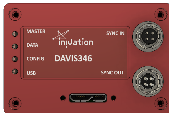
Figure 2 Connectors on the back of DAVIS 346

DAVIS 346 has three connectors on the back. One USB 3.0 connector for data and power, and two sync ports for syncing the camera with other cameras or external trigger devices