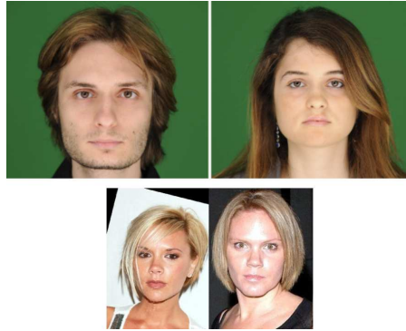
Figure 1: Pairs of siblings from the HQfaces (top row) and from the LQfaces (bottom row).