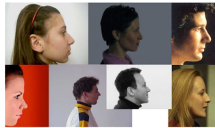
Fig. 1. profile images in the DB

The first problem to face for this work, as well as for other 2D or 3D beauty research, is the lack of databases containing faces rated for attractiveness, and in particular beautiful faces. Therefore, we decided to build such a database, collecting an initial set of profile images, with different resolutions, selected from several sources (Bernard Achermann DB, Color FERET DB, CVL Face DB, Flickr and color photographs of volunteers participating to this research). Some examples can be seen in Fig. 1. The reference database contains 510 profile images with neutral expression, different age and ethnicity (45 Africans, 68 Asians and 397 Caucasians) and equally divided between the two genders. In order to identify samples belonging to the manifolds of attractive and unattractive faces for our investigation, we asked a panel of human raters to evaluate their attractiveness. The obtained scores have then been used, to separate these two sets from that of attractively average faces.