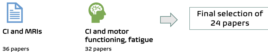
Figure 2: Works selection.

We looked at papers published between 2000 and 2021 that evaluate the cognitive impairment of at least one cognitive domain via a NP test (administered either via a traditional paper-and-pencil approach or a computerized approach), and that look for correlations between cognitive measures and other clinical evidences. We selected 36 papers that explore the relationship between CI and MR images characteristics, and 32 papers that explore the CI in connection with motor functioning, fatigue and depression, as shown in Figure 2.