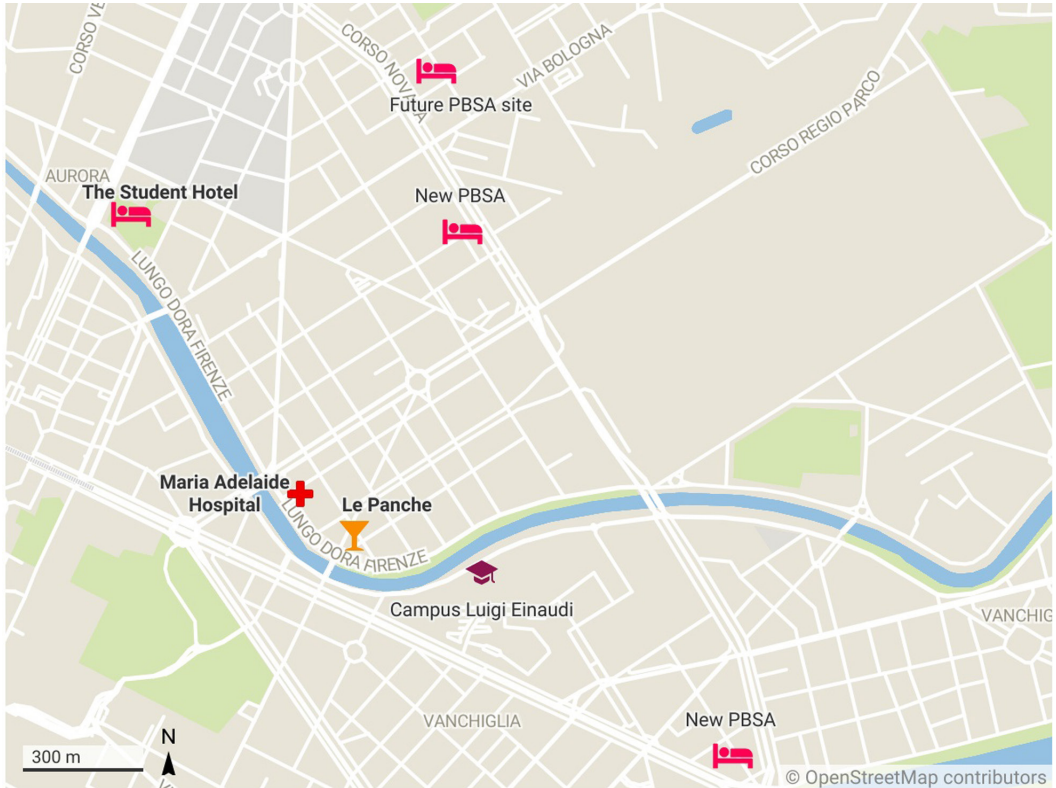
Figure 3. Studied area with the three sites of interest.

accommodate up to 300 students, while another Italian company, CX, has renovated a former office building to host 92 students in the proximity of the CLE. Other two PBSAs, close to each of the previous, are expected with the renovation of former office buildings.