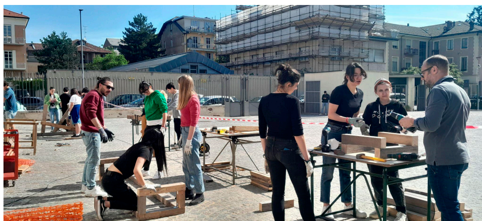
Figure 1. Example of hands-on experience carried out during a circular design workshop in collaboration with LaSTIn. The students made courtyard furniture with 0 km waste materials from a local construction site, becoming confident with equipment, connections, and reused materials.

Other experiences included DIY workshops based on waste material in order to apply certain principles of circular design (reuse, repurpose, upcycling, design for disassembly) to real-life projects. Construction site waste, such as pallets, sawdust, beams, and nets, became furniture (Figure 1), and old wine barrels became micro-architectures in vineyards. By engaging students in hands-on experiences, they are more able to connect theories to real-world situations.