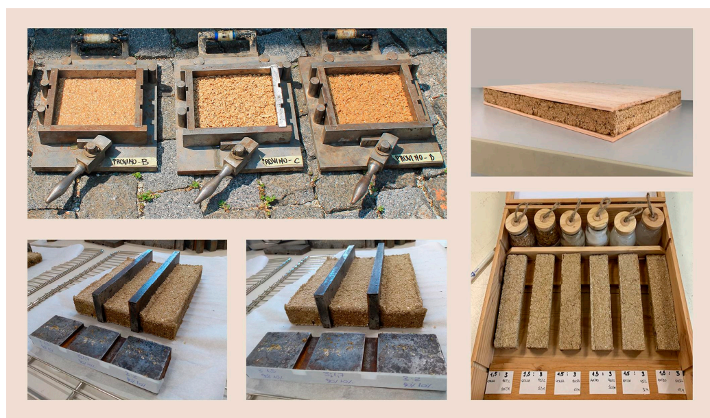
Figure 2. Examples of the samples created in the experimental phase to define the mix design.

The research generated a feasibility study for a panel made strictly of waste and byproducts of the rice supply chain that might be used as chipboard or as the inner layer of sandwich panels with wooden face sheets (Figure 2).