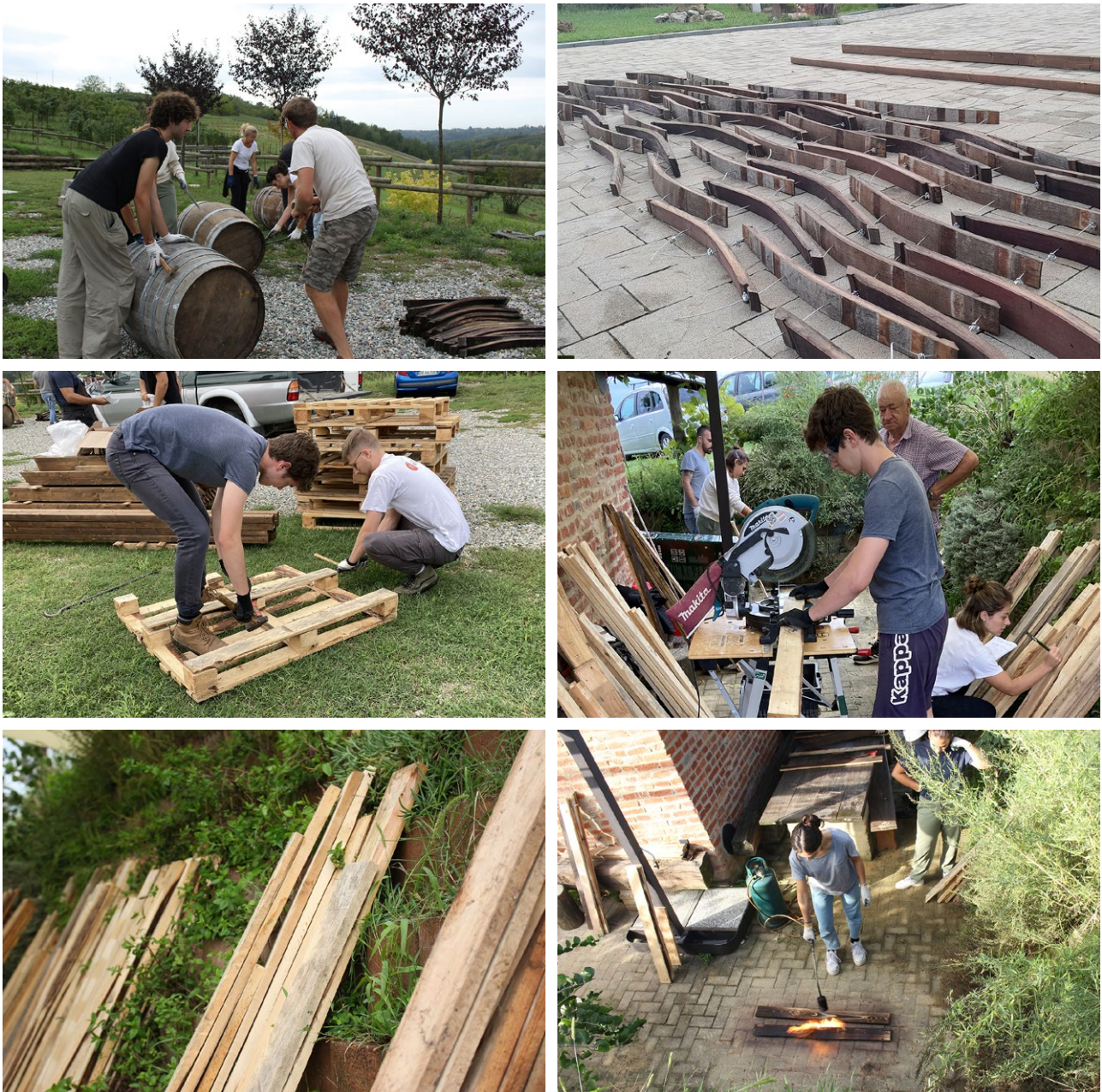
Figure 5 | Some activities of the off-site production phase: above, disassembly of the staves of the old barrels and anchoring on steel cables; middle and below, unnailling, selecting, cutting, and burning the planks recovered from the decommissioned pallets).