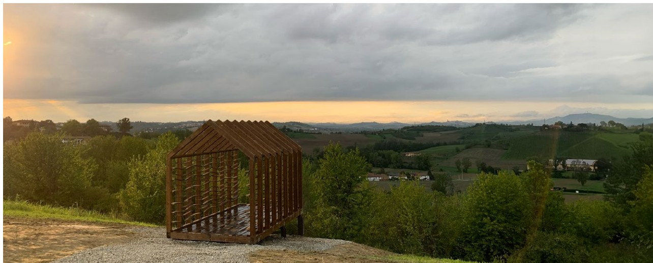
Figure 1 | The CiaBOT and the UNESCO World Heritage landscape of the Monferrato hills (AT, Italy).

Understanding among Politecnico di Torino (Department of Architecture and Design) and small and medium-sized Portacomaro's enterprises, interested in promoting land valorisation strategies based on a circular economy approach and the optimization of waste as a resource.