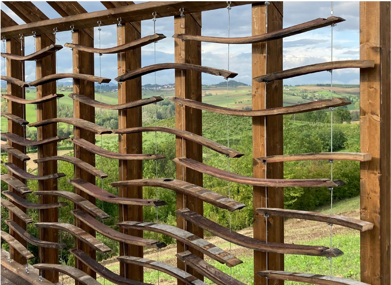
Figure 7 | Detail of the connections between barrel staves, steel cables and structure.

walks or bicycle rides, for a picnic or to celebrate events, tourists as a vantage point for taking photographs, and children like to dangle their legs by sticking them out from the side of the slope (Figure 8). An official opening with a public event is planned for May 2024 to acquaint a wider audience with the broader significance of this micro-architecture (of its high symbolic and representative power) and the replicability of a design model that can be extended to other territories and other networks of actors.