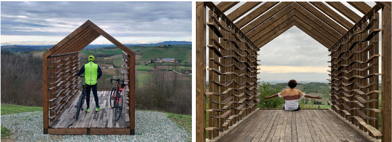
Figure 8 | People currently using CiaBOT. On the left a cyclist at a rest, on the right a young man meditating ‘embracing’ the landscape.

the materials with the greatest impact on the project. The pallet planks for the floor were mainly used in a functional/technical way. In this case, replacing the used planks with a new material would have further affected the environmental cost of the project. However, these do not communicate their original origin and therefore, on a communicative level they contribute less to explicitly convey the idea of circularity and sustainability to the users of CiaBOT.