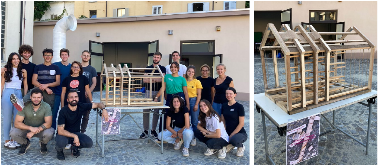
Figure 4 | Scale model of the micro-architecture. The realization of the model was functional to learn how to read the project, to understand its construction phases and to experiment with some of the processes that would be carried out in situ.

The workshop then moved from the LaSTIn laboratory to the project site at Portacomaro. As it was scheduled, the construction site lasted two days and was carried out in two construction phases: the off-site production stage and the on-site production stage.