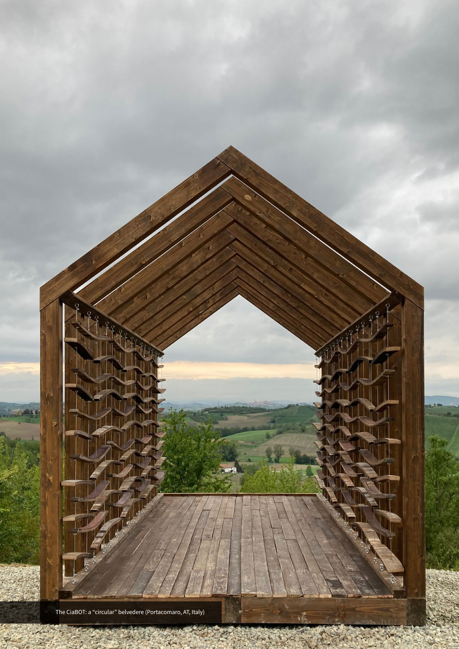
The CiaBOT: a "circular" belvedere (Portacomaro, AT, Italy)