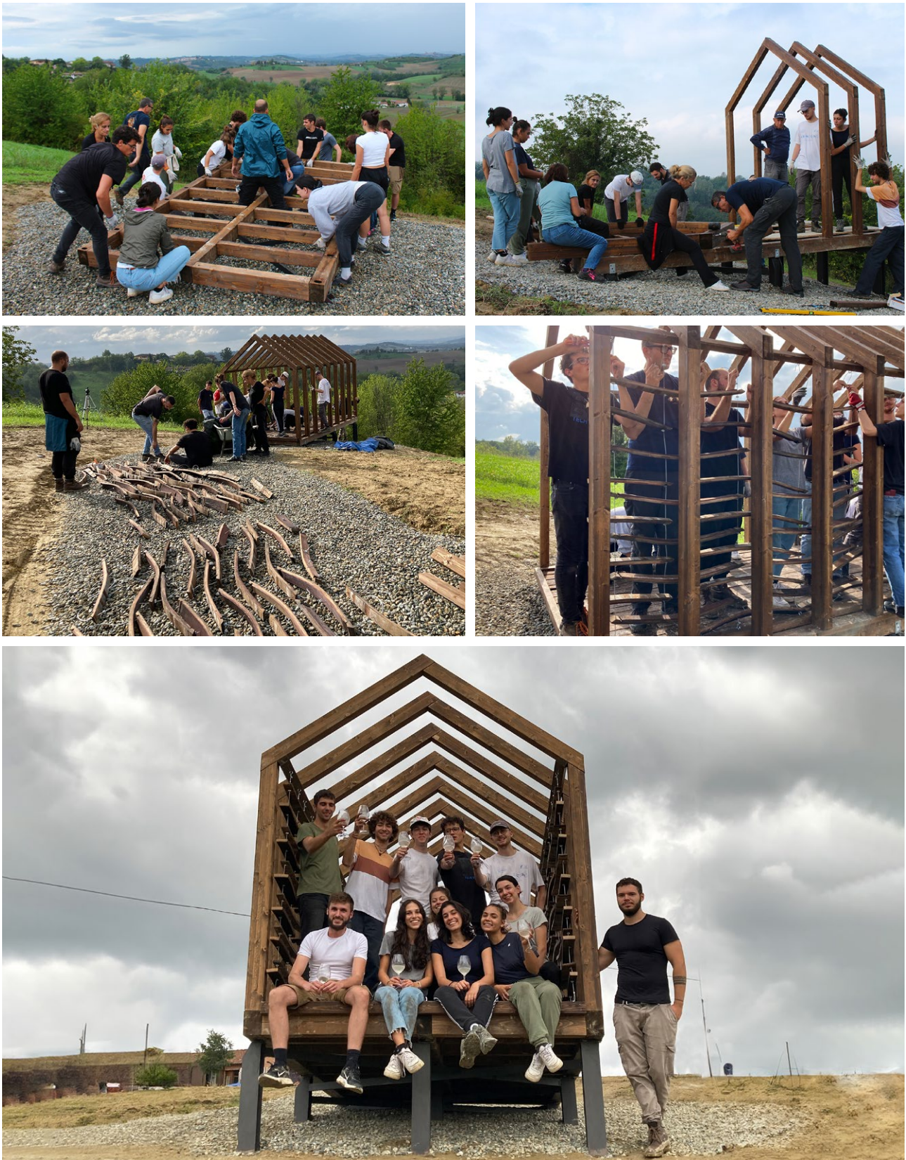
Figure 6 | On-site production phase: above, positioning of the floor beams on the foundations, assembly of the modular portals, anchoring of the barrique walls; below, the completed belvedere.