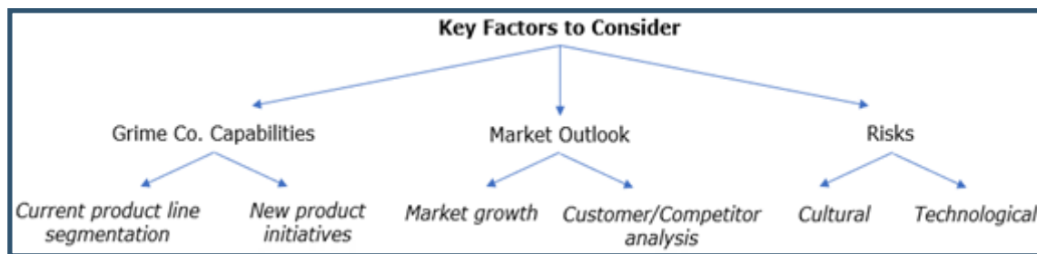
Figure 3. Example of advanced framework

This is an example of a more advanced framework; however, any strong framework will accomplish two objectives. First, it will show the interviewer that you have strong critical thinking skills; and second, it will help you complete the rest of the case by providing a framework for your analysis. When thinking about how you would like to break the case down, we have two recommendations of our own.