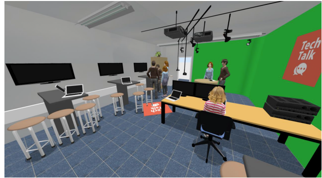
Figure 2: Conceptual sketch of the media studio.

To provide a better technical infrastructure and collaborative environment, we plan to build a small studio with the essential technical infrastructure and green screens that all students of our course can use. We are convinced that this will contribute to more