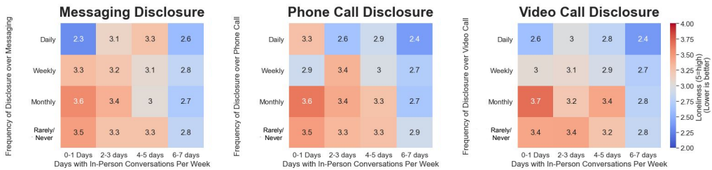
Fig. 2. The average social support and loneliness is plotted against the days with in-person interactions (x-axis) and the frequency of emotional disclosure across each private online platform (y-axis). The more frequent disclosure occurs online, regardless of in-person interactions, is associated with increased social support across all three platforms. Those with daily in-person interactions still benefit slightly from online disclosure across each platform. Conversely, those having fewer than 2 days of in-person interaction per week and overall no online contact are associated with the least amount of social support. In contrast, there does not seem to be a clear association between frequency of online disclosure and loneliness. Though users who disclose daily over video call seem to report lower levels of loneliness, daily disclosure over messaging and phone call does not consistently relate to lower loneliness.