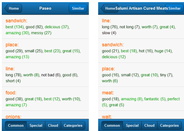
Figure 5: An example where two restaurants seem unrelated based on Yelp’s cuisine and price meta-data, but are noticeably similar when inspecting the finer-grained attributes extracted from reviews by REVMINER.

line” at Salumi; raving descriptions of the sandwiches and food at both restaurants, many mentions of the place being “small” as well as the seating being “limited” at Paseo and Salumi. From this, we can infer that these both attract lunch crowds where the long lines in front of small store with limited seating are worth the wait for delicious sandwiches. Thus, the metadata presented in the Yelp app’s search results page suggests there is little similarity between the two restaurants, but a deeper inspection by the similarity scoring system identifies a surprising similarity based on the extractions. Of course, REVMINER also performs well in common cases of finding similarity by typical attributes relating to cuisine, foods offered, service quality, etc.