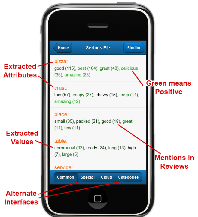
Figure 1: The REVMINER interface listing attributes and associated values extracted from Yelp reviews for the Serious Pie pizza restaurant in Seattle.

Copyright 2012 ACM 978-1-4503-1580-7/12/10...$15.00.