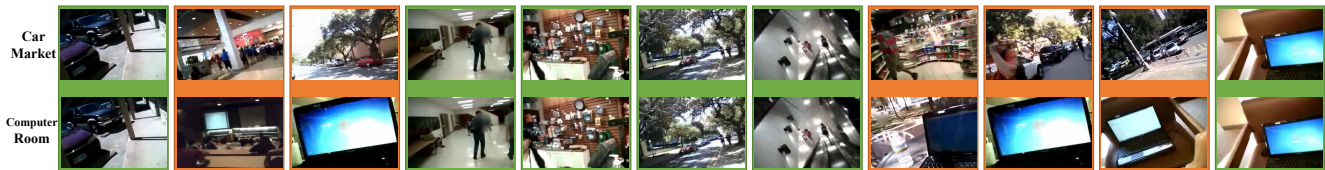
Figure 2: This figure compares two user summaries (generated by the same user) for two different queries. Both summaries contain shared segments, that are assumed important in the context of the video, while they disagree on the query-relevant segments.