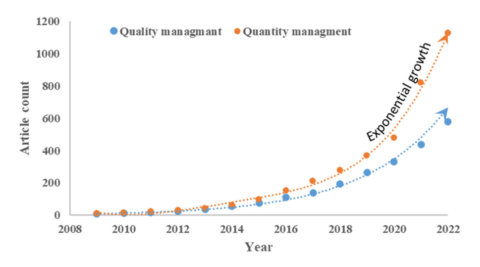
Figure 1. Arithmetical conceptualisation of growth observed in groundwater quality and quantity research using a Hybrid AI-based model during 2009–2022. Note that while these databases are comprehensive, they may not include every article published on a topic, as not all journals and conference proceedings are indexed in the Scopus database.