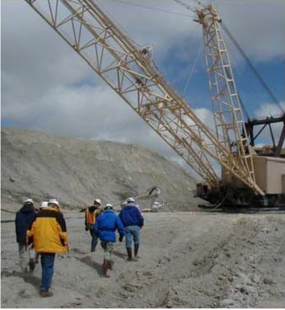
Inspecting the Dragline at the Black Butte Mine, Wyoming