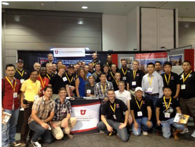
MinEXPO 2012 – Las Vegas, Nevada

Student loans, grants, and need-based and other scholarships are also available through the financial aid office (105 SSB, 581-6211).