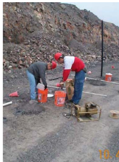
Students Gain Practical Experience in Many Areas, Including Surveying