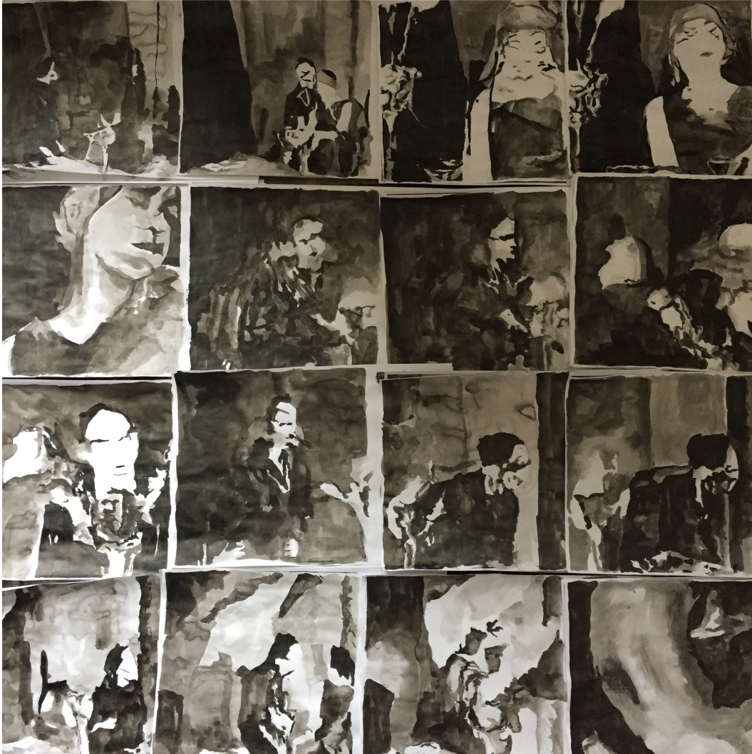
Figure 4: samples of redrawn GAN imagery in ink from Fall of House of Usher .