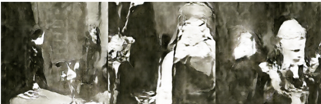
Figure 3: Stills from Fall of House of Usher .