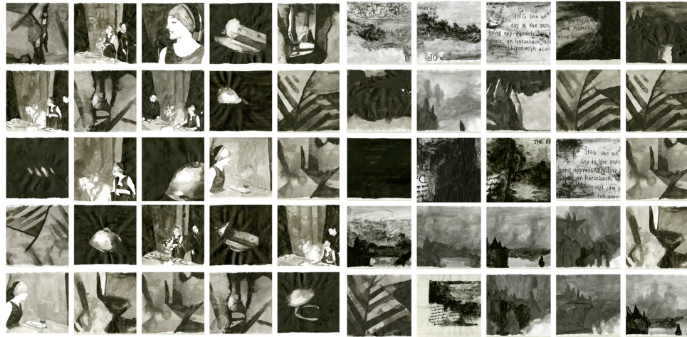
Figure 1: Hand drawn elements for training set for Fall of House of Usher .