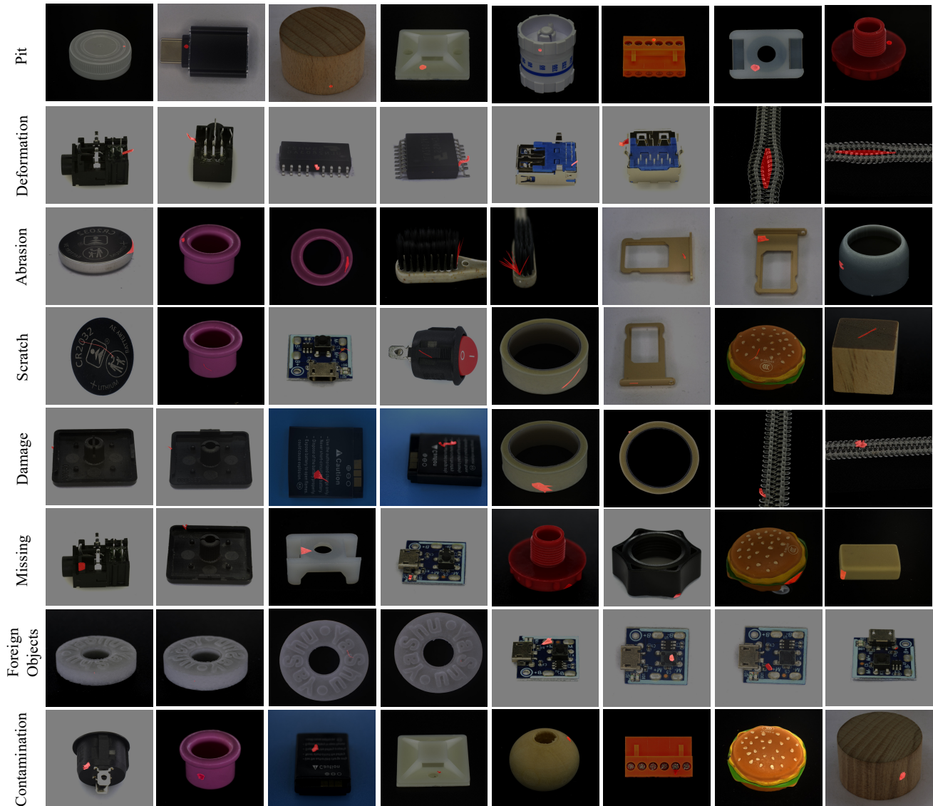
Figure 1. Anomalies Visualization of Real-IAD. Each row represents an anomaly class from different products and diverse locations. From top to bottom, they are pit, deformation, abrasion, scratch, damage, missing, foreign objects, and contamination, respectively.

In this supplementary material, we first give all 30 object visualizations including 12 complex products (mixed material and surfaces with complex geometries) and 18 simple products (single material, e.g., metal, plastic, wood, ceramics and etc., and simple and smooth surfaces) in Real-IAD in Fig 2. Then, some representative anomaly images covering all 8 defects, i.e., pit, deformation, abrasion, scratch, damage, missing, foreign objects, and contamination, are shown in Fig 1. In our main paper, we only report averaged results for all methods, here complete experimental results of all categories with both UIAD and FUIAD settings are reported in Tabs. 1, 2, 3, 4, 5 and 6.