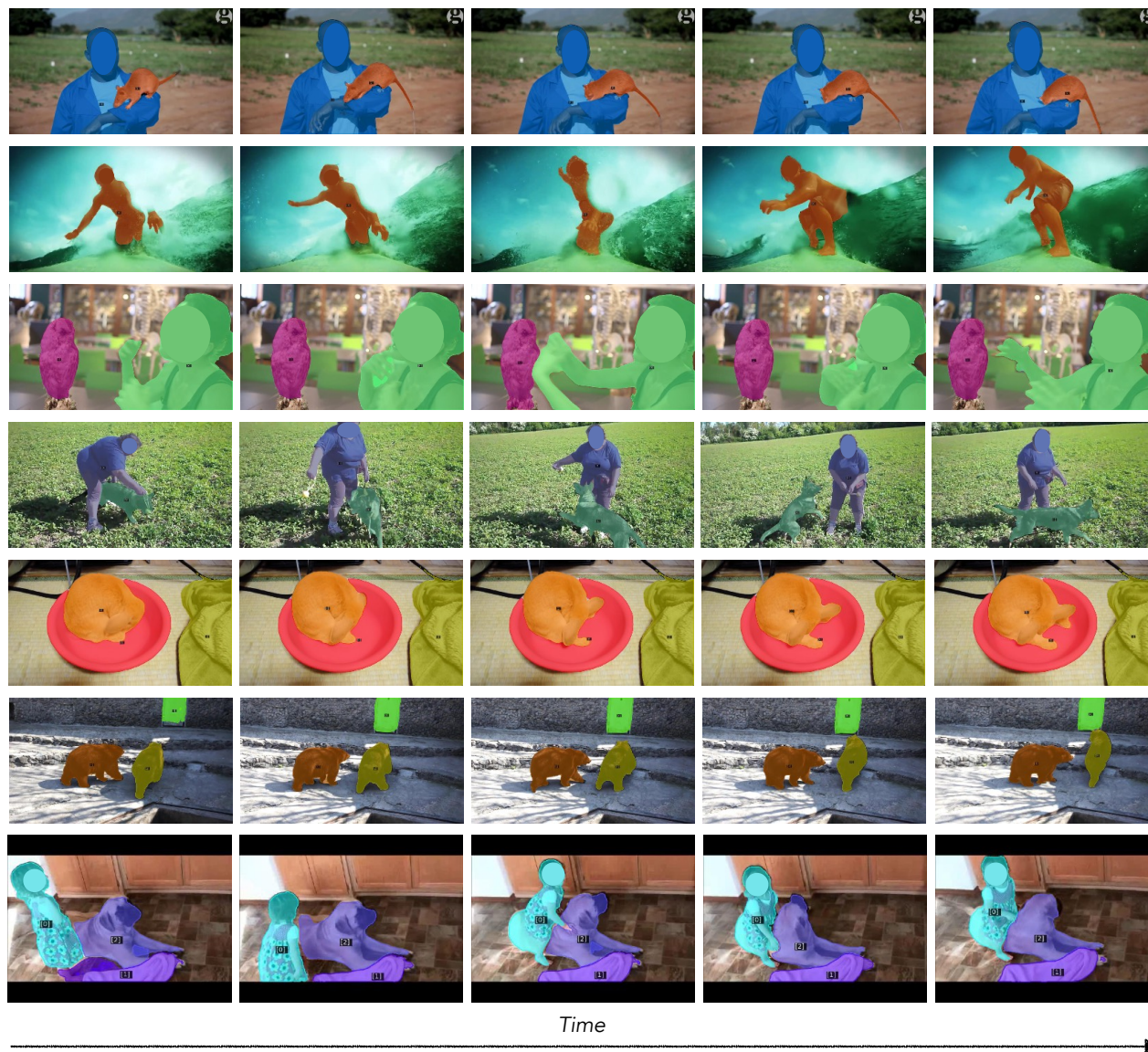
Figure A.1. We present additional qualitative visualizations (Figures A1-A5) showcasing the zero-shot unsupervised video instance segmentation results of VideoCutLER on YoutubeVIS. VideoCutLER is pretrained on image dataset ImageNet-1K and directly evaluated on video dataset YouTubeVIS.