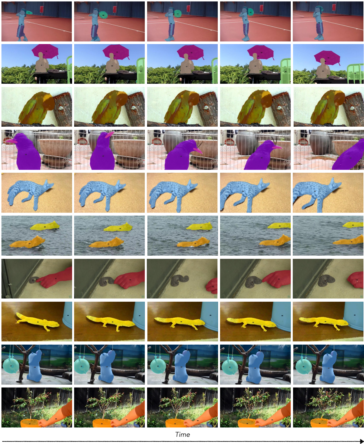
Figure A.4. Additional qualitative visualizations.