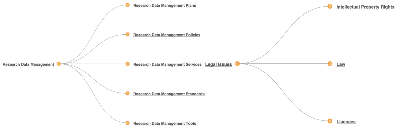
Figure 2. Research Data Management and Legal Issues Taxonomies