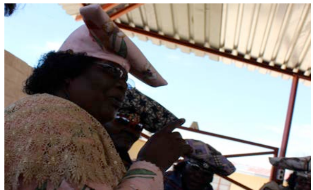
Figure 2. Participant asks researcher on “who they are”. ... of avoiding losing face [51]. It also provided focus on people’s goals, requirements and traits to do with recovering authority on owned cattle and with traditionally-bound gendered issues, as well

In this session in the village of Okomakuara, eight women talked about the niceness of families and their likeability of flowers as described in [10]. Participants agreed on families being nice and flowers likeable. Yet, when kindly asked if they garden any flowers, they in turn acknowledged not doing so. Requested to move into matters of present concern towards improving futures, a participant immediately sparked a query on whether foreign researcher posing the request knew who they were (Figure 2). Researcher answered a friendly Hereros and, we observed, this somewhat functioned as a cue to the rest of the group in that a participant overtly conveyed her desire to regain the cattle she had lost against her brother, and for which her daughter furthermore expressed the need to own a computer to manage such cattle [10].