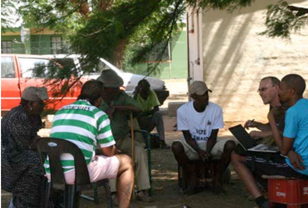
Figure 3. Elder couple interview, Otjinene.

In the village of Otjinene, a focus group with an elder couple revealed data about chores and the physical arrangement of the homestead, and on affordances in and around the house [10]. Data on husband's "elder status" also emerged through objects that he genuinely owns like a hat, a chair, a knife and a cane (Figure 3).