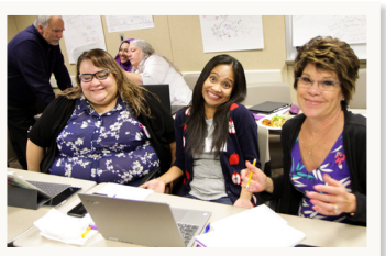
DLAC 2018 Participants