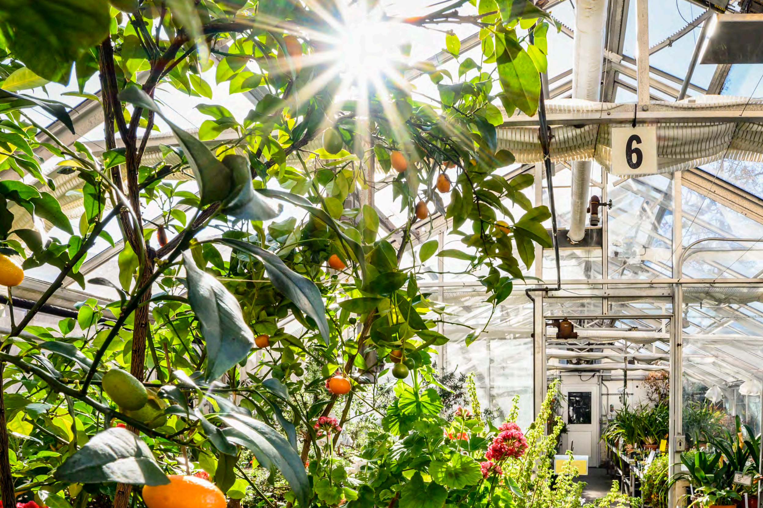
Sunlight shines through the glass roof of the Botany Greenhouse, warming plant life on a winter day. Located in Birge Hall, the greenhouse features eight distinctive rooms that take visitors on a journey that includes tropical, desert, bog, and woodland environments.