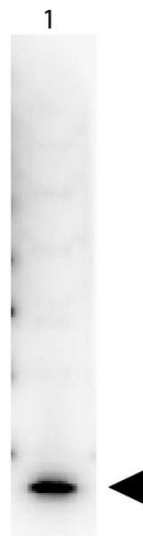
Image 1. Western Blot Results using Streptavidin Peroxidase Conjugate and Goat Anti-GST Biotin Conjugate Antibodies. Lane 1: Opal prestained molecular weight ladder. Lane 2: GST (ABIN964157) [0.05 µg]. Primary Antibody: Goat Anti-GST Biotin Conjugate (ABIN99864) at 1.0µg/mL overnight at 4°C. Secondary Antibody; Streptavidin Peroxidase Conjugate at 1:40,000 for 30mins at RT. Block: Blocking Buffer for Fluorescent Western Blotting (ABIN925618) for 30mins at RT. Exp: 5 sec.