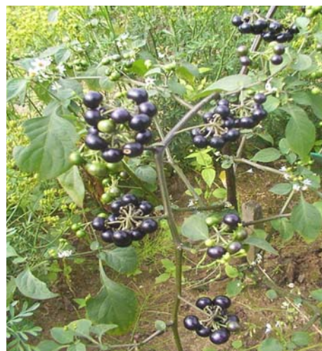
Fig 1: Whole plant of Solanum nigrum

The berries and leaves are mainly used for medicinal purposes, besides the other parts of the whole plant. The leaves are used as poultice for rheumatic and gouty joints (Disease causing the