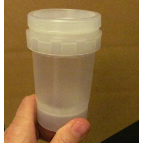
FIGURE 4.18 SAMPLE READY FOR TRANSPORT TO THE LABORATORY