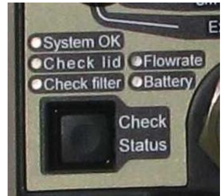
FIGURE 3.2 CHECK STATUS BUTTON AND LEDs

The ACD-200 is equipped with five LEDs that communicate the status of the unit to the user. The appropriate LEDs are illuminated when “Check Status” button is pushed. The red “Check lid” LED is illuminated when the lid is open or the lid release is not completely pushed in. The red “Check filter” LED is illuminated if there is not a filter cassette present in the sampler. The “Flowrate” LED is illuminated when the internal mass flow sensor is measuring a flow rate less than what has been selected. This may be due to an overloaded filter or a blockage at the exhaust vents located on the bottom of the unit. The “Battery” LED is illuminated when the battery needs to be recharged.