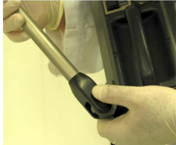
FIGURE 4.2 UNLOCKING AND UNFOLDING LEG

Unfold the leg until the push pin pops out and locks the leg into place as shown in Figure 4.3. Open the leg latches, as shown in Figure 4.4, and telescope the legs out to the desired height.