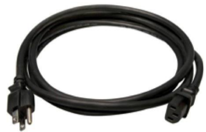
FIGURE 4.7 AC POWER CORD