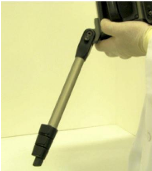
FIGURE 4.3 LEG PUSH PIN LOCKED IN PLACE

Unfold the leg until the push pin pops out and locks the leg into place as shown in Figure 4.3. Open the leg latches, as shown in Figure 4.4, and telescope the legs out to the desired height.