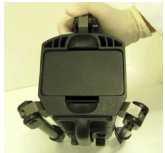
FIGURE 4.8 BATTERY COVER ON THE BOTTOM OF THE UNIT

The battery is installed into the unit with the battery socket towards the front of the unit as shown in Figure 4.11. Reinstall the Battery Cover by pushing it into the bottom of the unit until both clips click into place.