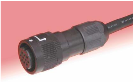
FIGURE 4.5 10-PIN CONNECTOR ON POWER AND COMMUNICATION CABLE

Communication Cable. Plug one end of the AC Power Cord (Figure 4.7) into the External Power Supply and plug the other end into an appropriate wall outlet.