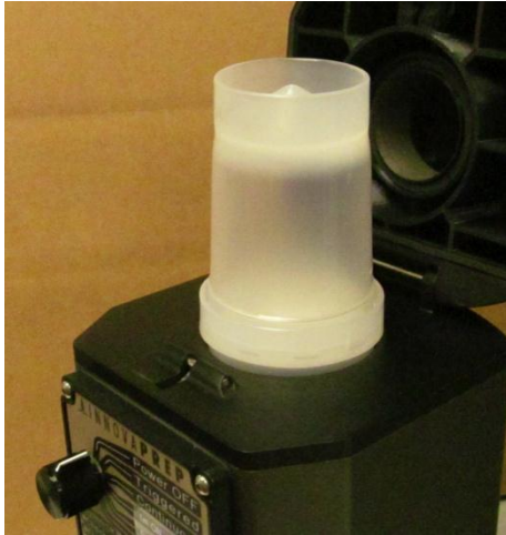
FIGURE 4.16 SAMPLE CUP SNAPPED INTO THE FILTER CASSETTE

When the run is completed, the filter sample is recovered by unlatching the lid of the unit, reaching in and snapping the sample cup into the top of the filter cassette as shown in Figure 4.16. The filter cassette and sample cup are then lifted out of the collector, flipped over, and capped with the sample cup cap as shown in Figure 4.17. The assembly, as shown in Figure 4.18, can then be transported to a laboratory space for elution or may be eluted while in the field.