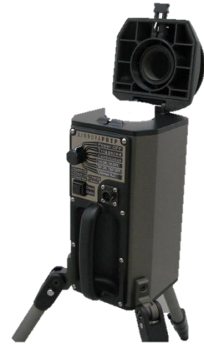
FIGURE 1.1 ACD-200 BOBCAT

The InnovaPrep ACD-200 Bobcat, shown in Figure 1.1, is a lightweight, portable, dry filter air sampler with a unique rapid filter elution system. The Bobcat aerosol collector takes up little more than one-quarter of a cubic foot, has an internal battery, built-in tripod, and can run continuously at 200 liters per minute for up to 18 hours. The system has a built-in, omni-directional aerosol inlet, easy to read status display, and a built-in handle. The system is equipped with a mass flow sensor that allows for consistent sampling rates through out the collection cycle. It can be operated in four programmable run modes that allow the user to balance collection rate with battery life. The system is easy to use and operators can be trained in a little as 10 minutes. Installation of the filter cassettes and the controls can be manipulated with gloved hands, while wearing personal protective equipment such as military-style nuclear/biological/chemical (NBC) protective suits.