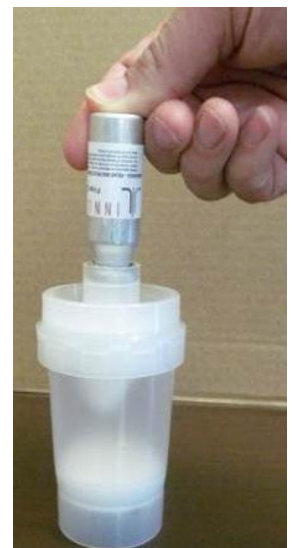
FIGURE 4.19 ELUTION OF FILTER