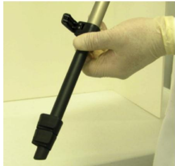
FIGURE 4.4 OPENING LEG LATCH FOR ADJUSTMENT

Supporting the back of the unit with one hand, push the 10-Pin Connector (see Figure 4-5) on the Power and Communication Cable into the Power and Communication Port on the front of the unit. It will automatically lock into place. Push the barrel plug on the external power supply (see Figure 4.6) into the barrel jack on the Power and