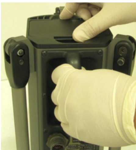
FIGURE 4.9 PINCHING CLIPS ON BATTERY COVER