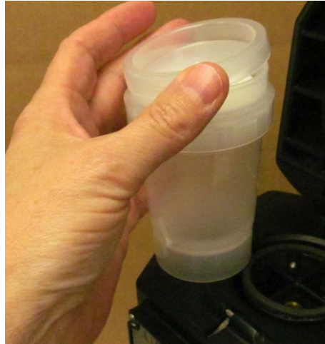
FIGURE 4.17 SAMPLE CUP LID SNAPPED INTO THE FILTER CASSETTE