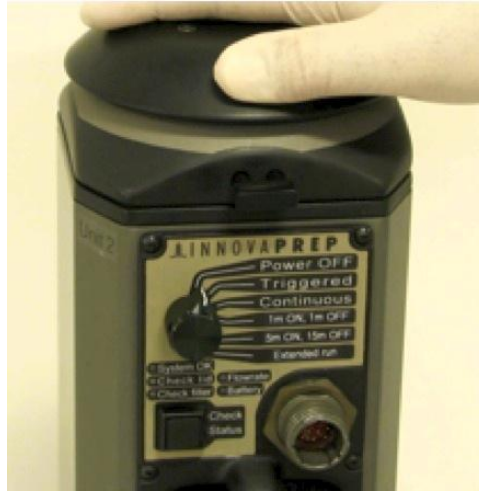
FIGURE 4.13 CLOSING LID