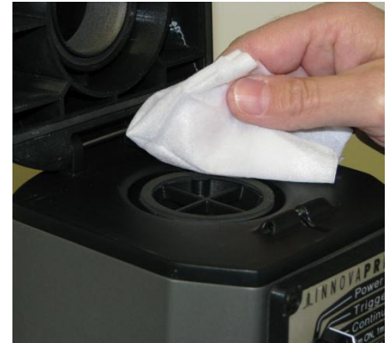
FIGURE 4.22 CLEANING INTERIOR SURFACES