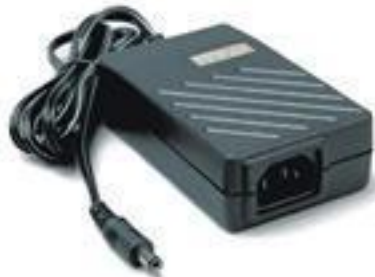
FIGURE 4.6 EXTERNAL POWER SUPPLY WITH BARREL PLUG