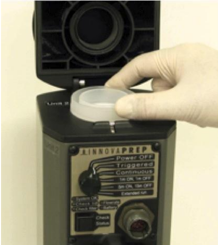
FIGURE 4.12 INSTALLING FILTER CASSETTE

Open the ACD-200 by putting one hand on top of the unit and, grasping the Lid, grip the Release with your other hand and pull the Lid Release straight out. The top will now open on its hinge. Set the filter cassette into the top of the ACD-200 and press it firmly into place, as shown in Figure 4.12. The filter housing is designed to only fit in one way one way. Close the lid and hold it down while pushing the lid latch straight in to lock it in place, as shown in Figures 4.13 and 4.14.