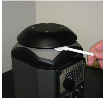
FIGURE 4.21 CLEANING INLET WITH FOAM TIPPED APPLICATOR