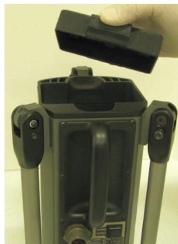
FIGURE 4.10 REMOVING BATTERY COVER