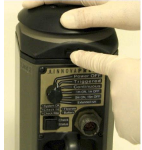
FIGURE 4.14 ENGAGING LATCH