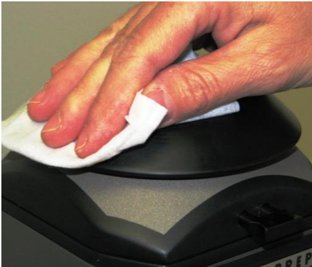
FIGURE 4.20 CLEANING EXTERIOR SURFACES

Open one of the cleaning wipe packets contained in the Bobcat Cleaning and Maintenance Kit and use the enclosed towelette to wipe down the exterior surface of the inlet as shown in Figure 4.20. Wet the foam tipped applicator with the cleaning wipe and clean the inlet under the inlet cap as shown in Figure 4.21. Open the second cleaning wipe packet contained in the Bobcat Cleaning and Maintenance Kit and use the enclosed towelette to wipe down the interior surfaces of the sampler as shown in Figure 4.22.