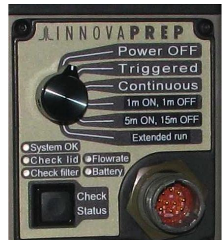
FIGURE 4.15 MODE SELECTION KNOB

To operate the unit in the “Triggered” mode, the user will need to contact InnovaPrep to design a program specific to the user’s requirements. The software loaded on the Bobcat does not allow for operation in this mode unless the user requested this option at the time of purchase.