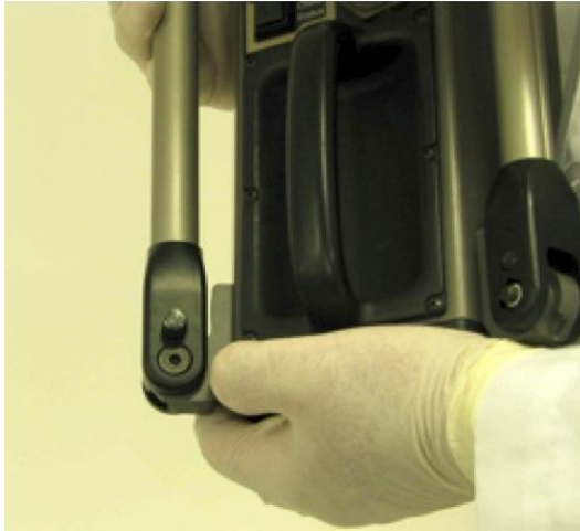
FIGURE 4.1 LOCKING PUSH PIN LOCATION AT LEG HINGE

Select the desired area for sample collection. For each leg, push the locking push pin located on the leg hinge at the base of the Bobcat as shown in Figure 4-1 and 4-2. It should be noted that the Bobcat cannot be operated with the legs in the upright position since the exhaust vents are located on the bottom of the unit.