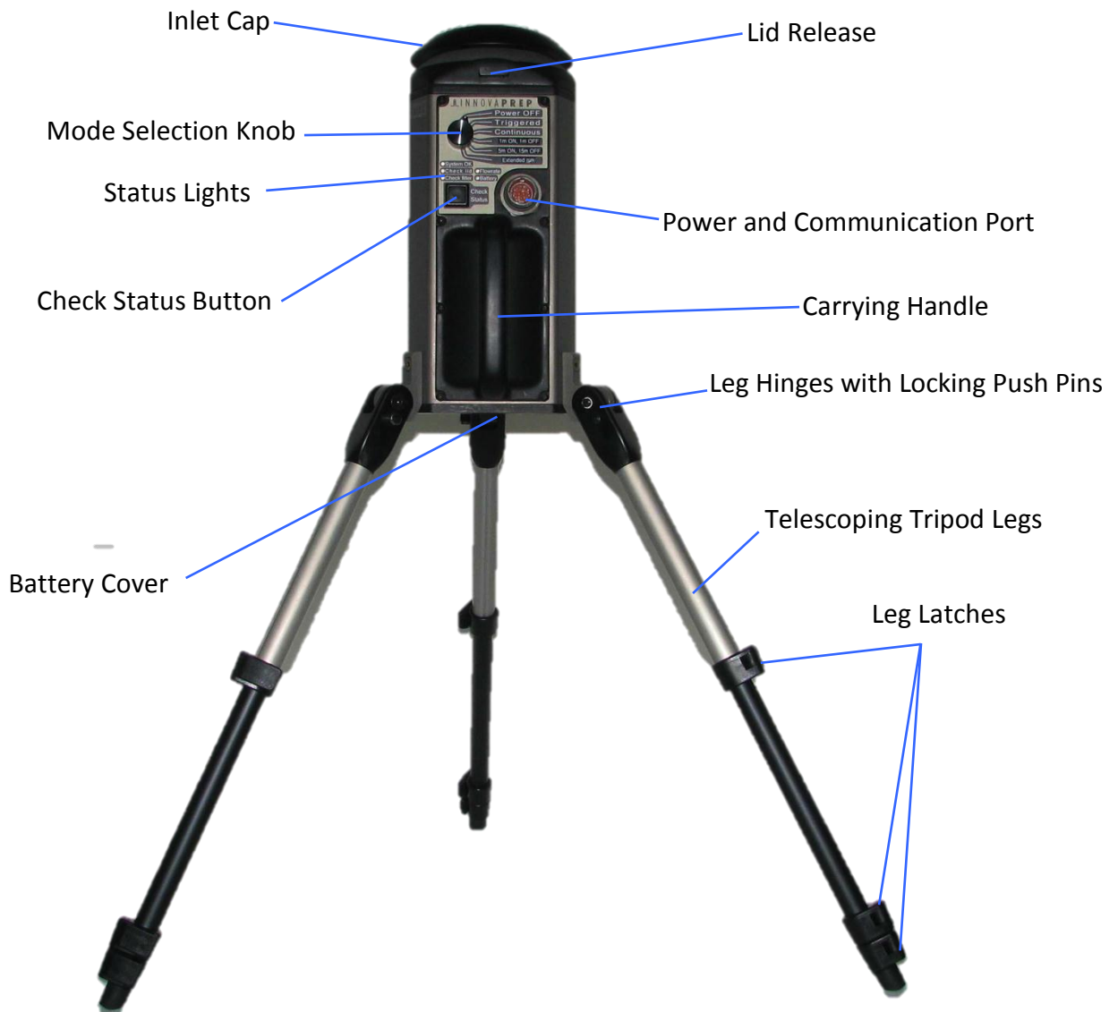
FIGURE 3.1 COMPONENTS OF THE ACD-200 BOBCAT

The following section describes the components of the InnovaPrep ACD-200 Bobcat air sampler.