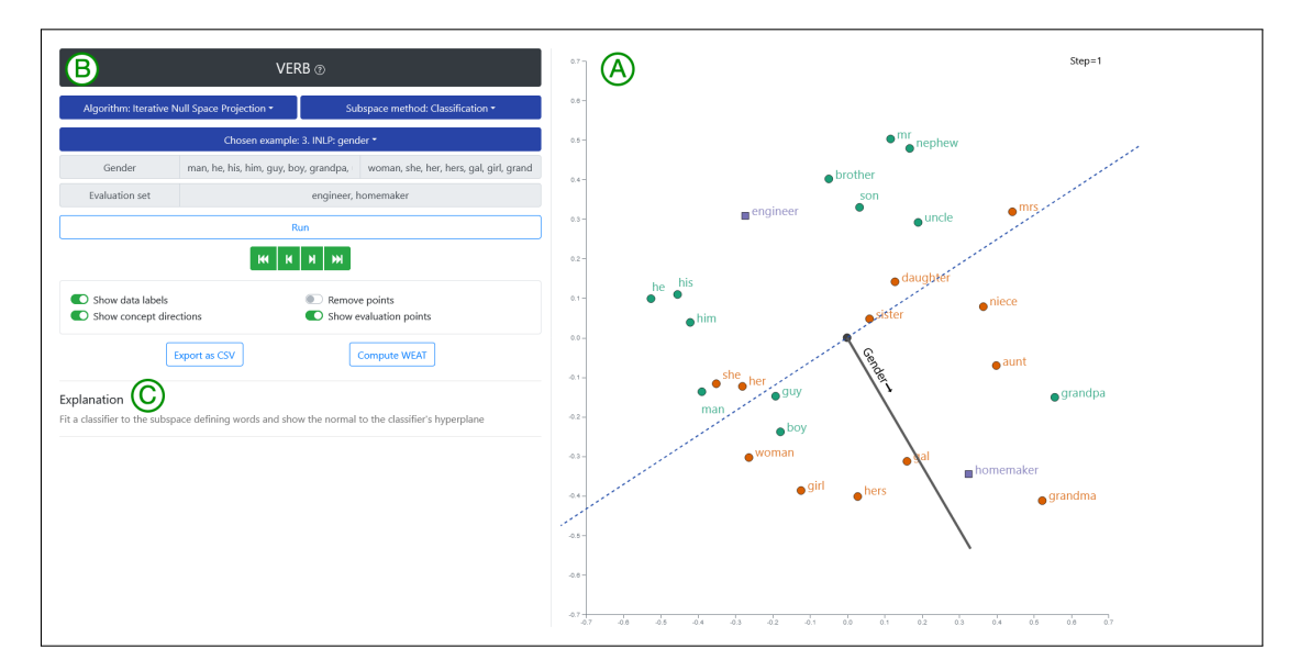
Figure 1: With VERB, users can explore the high-dimensional word representations interactively before, during, and after applying bias mitigation techniques. (A) Embedding View highlights a subset of word embeddings using dimensionality reduction and visualizes the step-by-step transformations of their embeddings. (B) Control Panel enables users to configure each debiasing technique and provides controls to iterate through each step of the transformation. (C) Explanation Panel provides a description of the transformation.