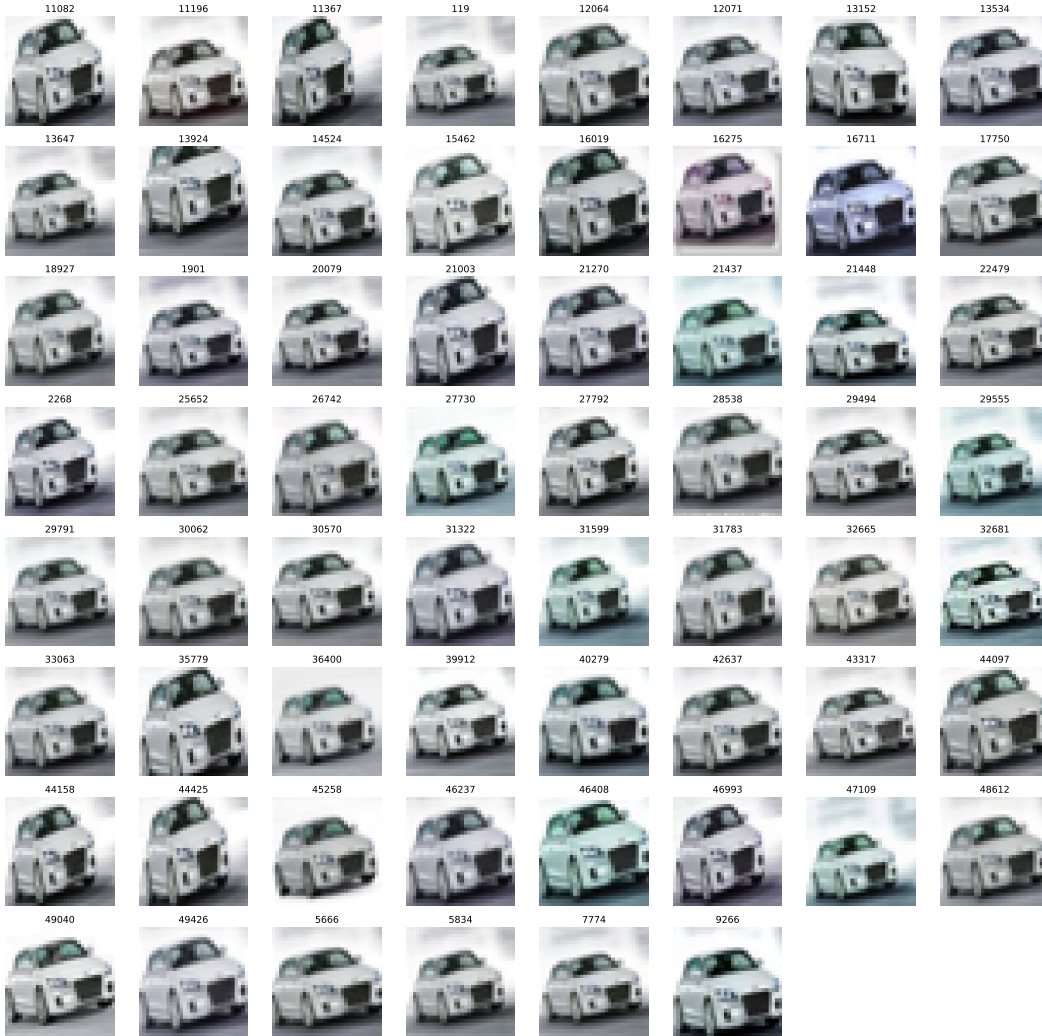
Figure 9: Duplicated images from the CIFAR-10 training set identified by the open source image deduplication library imagededup [17]. The number on top of each image is its index in the original CIFAR10 training set ordering.

508 We use the open source image deduplication library imagededup [17], available at https://github.com/ideal0/imagededup , to deduplicate the CIFAR-10 training set. Specifically, we use 509 the Convolutional Neural Network based detection algorithm with a threshold of 0.85, which ended 510 up removing 5,275 duplicated images from the training set. We have manually inspected a random 511 set of duplicated clusters identified by the software to verify the correctness. Figure 9 visualizes one 512 of the largest duplicated clusters identified by the software to verify the correctness. Figure 9 visualizes one 513 of the largest duplicated clusters identified.