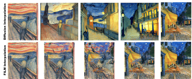
Figure 3: Application of diffusion and FILM interpolation.

In this section, we offer a visual comparison of the aforementioned interpolation techniques, each employed individually (see Fig.3). When solely relying on diffusion for interpolation, the resulting videos lack both motion and temporal coherence [Wang and Golland 2023]. On the other hand, applying the FILM model directly to paintings A and B yields smooth videos that suffer from spatial inconsistency. In contrast, ArtWalks leverages the strengths of both approaches, preserving both temporal and spatial consistency in the generated videos.