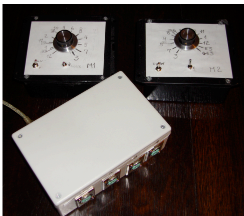
Figure 1. The hardware controllers and interface.

Everything fits into one briefcase, with the only larger piece of hardware required being a FireWire interface.