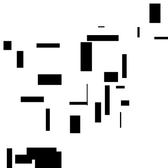
Figure 4. The ‘graphic’ of Variation 8

The relationship that exists between compositions which use these methods and improvisation also needs investigation. Figures 2 and 3 (also see Figure 4) show contrasting phrases which have been generated live during rehearsal or performance. The instrumentalist, in this case a pianist, is presented with very specific pitches and durations to play.