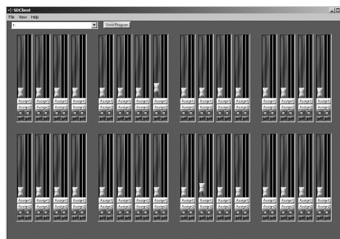
Figure 3. The Main window mirroring the hardware.

The main window (figure 3) mirrors the hardware in front of the user with options for assignment and the meters display the output of that fader, whatever its assignment. Clearly, maintaining the knowledge of a fader’s role is required throughout the performance (especially where the role may change); this aspect of ‘difficulty’ has already been noted and other indicators are under investigation.