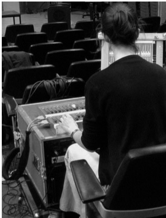
Figure 4. M2 in rehearsal. The console rests upon a flight case containing Motu24i/o hardwired to XLR patchbay, Atomic, Midi interface and rack-mount PC running both client and server.

the user to select an input or output by name or an output by connected loudspeaker name; Matrix DSP algorithms for delay and EQ. Real-time streaming audio and increased security: critical settings lock-down; automatic backup; password protection.