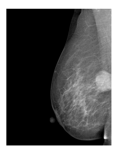
Fig. 2a. Original mammography