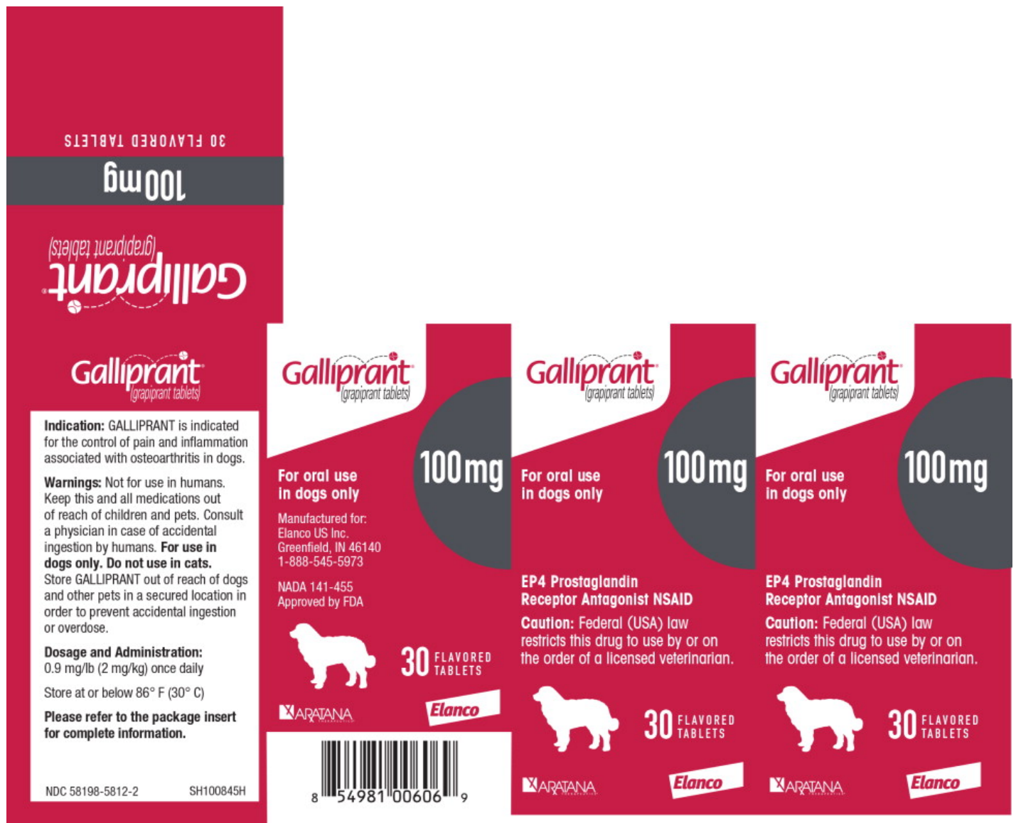
Principal Display Panel - Galliprant 100 mg 30 Tablets Bottle Label