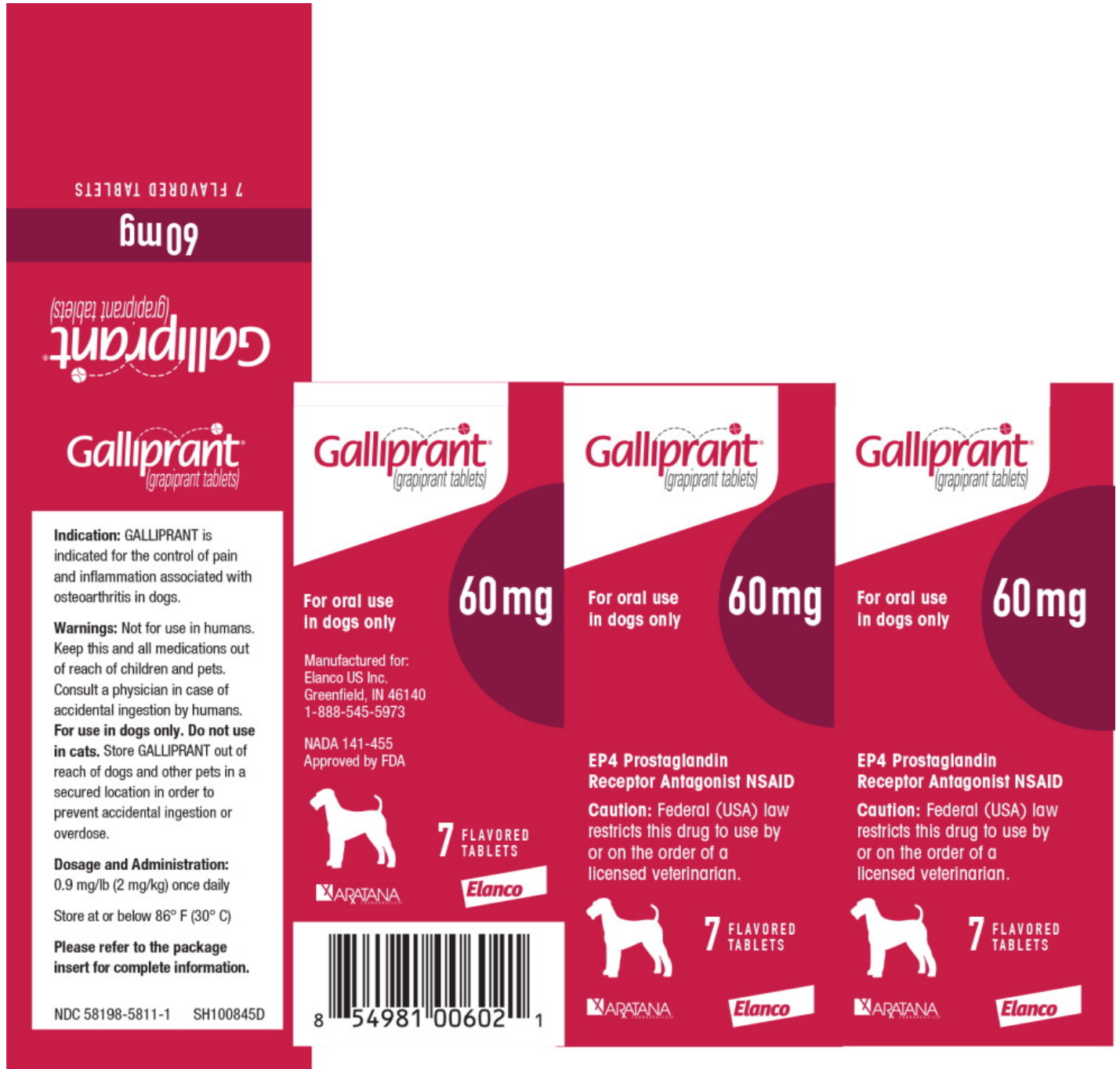
Principal Display Panel - Galliprant 60 mg 7 Tablets Bottle Label