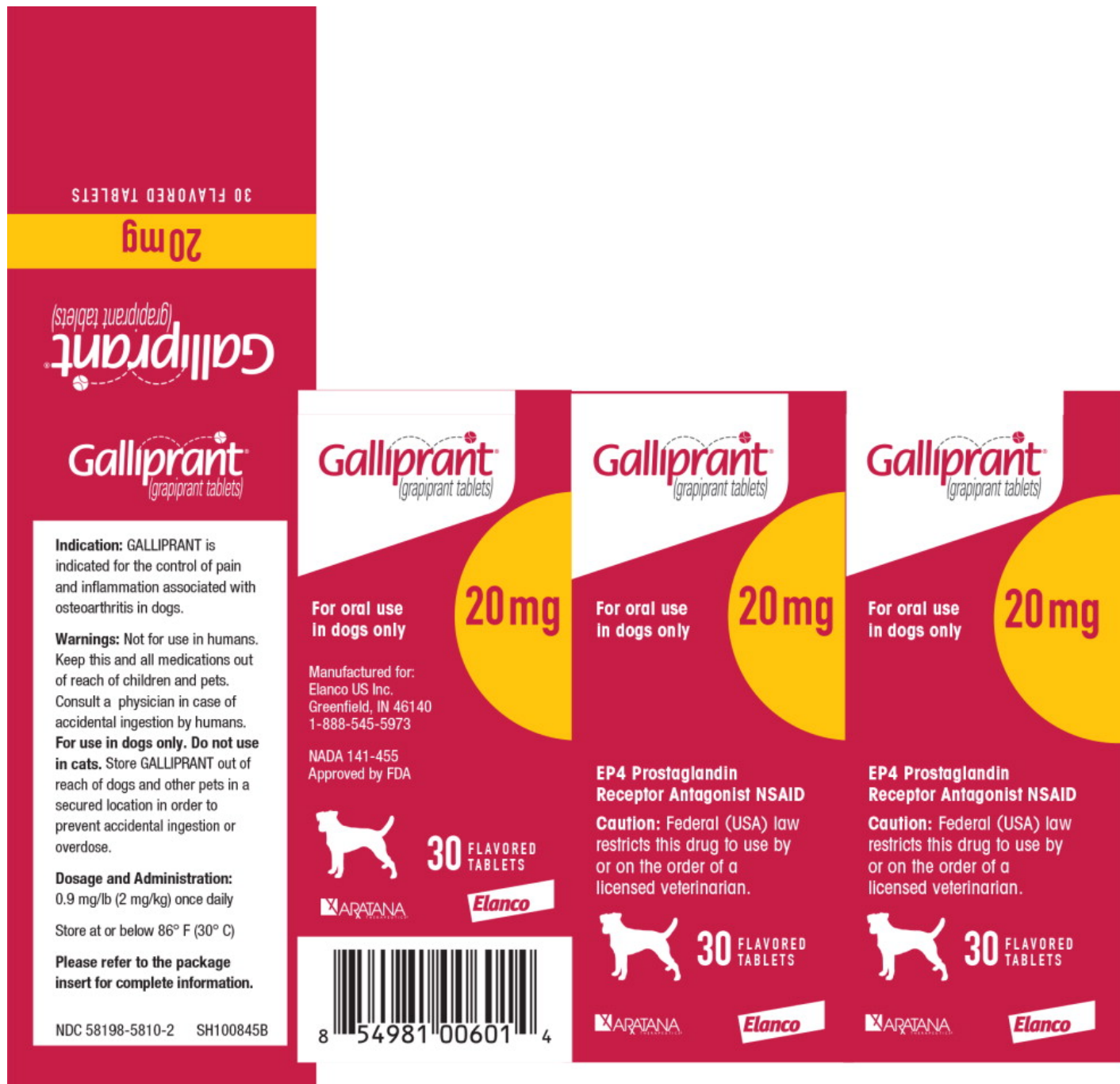
Principal Display Panel - Galliprant 20 mg 30 Tablets Bottle Label