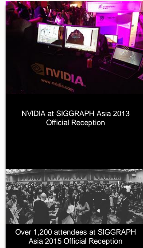
NVIDIA at SIGGRAPH Asia 2013 Official Reception