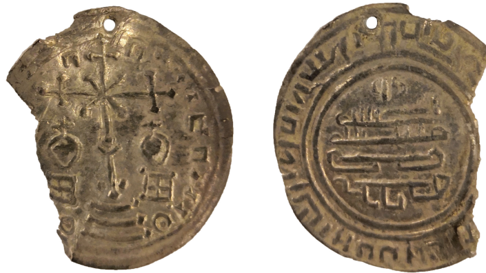
Fig. 4. Between two worlds: a pierced coin imitation, found in Nousiainen, Varsinais-Suomi in 2020. The obverse of the coin imitates a Byzantine miliaresion and the reverse an Islamic dirham. A similar imitation has been found in Estonia across the Gulf of Finland, in a hoard with a terminus post quem of 1089, suggesting a regional origin.

developed in CoinSampo could be used in the future to identify and provenance illicit artefacts by creating a vast, freely accessible and easily operable analysis-driven reference catalogues including object imagery for professionals involved in heritage crime law enforcement, and thereby helping to protect material culture from black market operators.