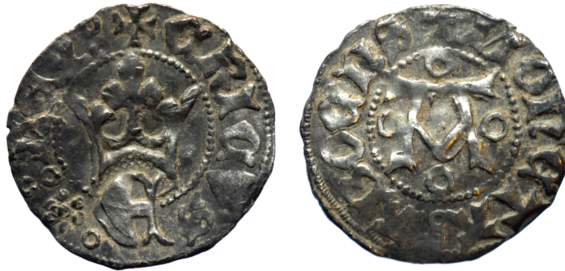
Fig. 1. The amount of new numismatic data in Finland has significantly increased in the last decade. A rare example of a medieval coin minted in Finland: an Abo type coin minted in Turku during the reign of Erik of Pomerania (c. 1410-1420). Only one coin of this type was known until 2017, when a metal-detectorist found this coin on a field in Häme, Finland. Since then one more fragment of this coin type has been found, showing that it was not so unique after all. National Museum of Finland, RK2017006:1.

DIME 10 ), the Netherlands (Portable Antiquities of the Netherlands, PAN 11 ), Belgium (MEDEA 12 ), as well as Estonia, the Czech Republic and Norway [1, 8, 9, 26, 30, 49]. Besides reaching out to the public to record the finds they make, which in some cases is mandatory, 13 these schemes inform the public of the laws and guidelines related to metal-detecting and other public searching 14 (especially encouraging responsible behaviour), and assist law enforcement in response to illegal metal-detecting, damage to historic monuments, and the failure to report certain categories of finds [6].