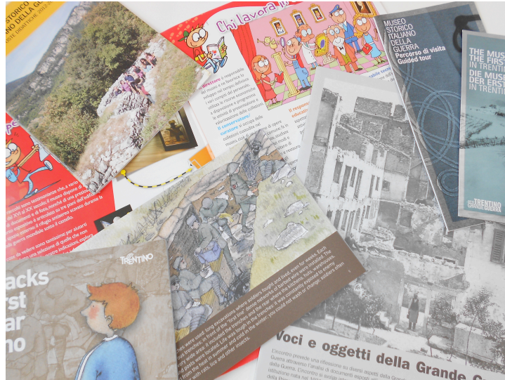
Figure 1: Museums produce a large variety of material tailored to specific visitors: the colourful, treasure hunt brochure and the graphic story for children; the trekking for teenagers; and more reflective material for older visitors.

There is an opportunity for interaction design to take advantage of the visitors' physical experience with cultural heritage and work to integrate technology into it instead of creating a parallel and detached digital experience. This needs the right sensibility and it is not without challenges. The design of digital into physical has to consider the complex ecology of cultural heritage with the conflicting goals of curators, visitors, and technology providers: