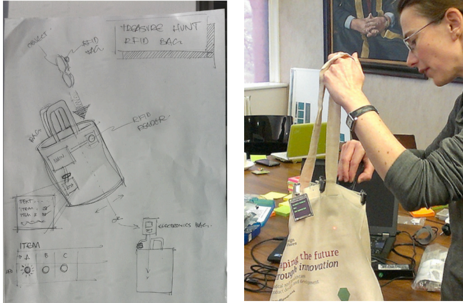
Figure 3: A concept from the co-design workshop: an interactive bag where children can collect smart items around the museum and get feedback when putting them in. The initial sketch on paper and in hardware.