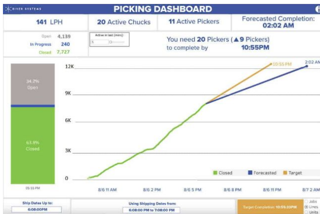
Analyze Demand and Deploy Resources as Needed