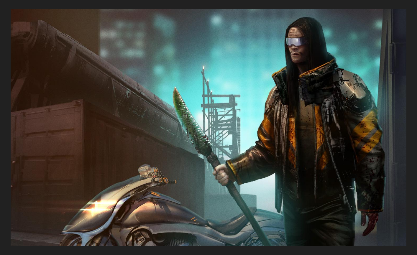
The Baddest Motherfucker in the World