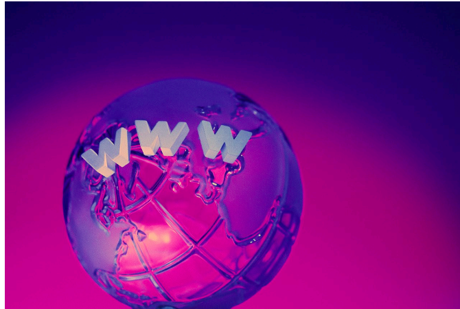
Figure 1. Figure captions are indented 5 spaces and justified. If you are familiar with Word styles, you can insert a field code called Seq figure which automatically numbers your figures.