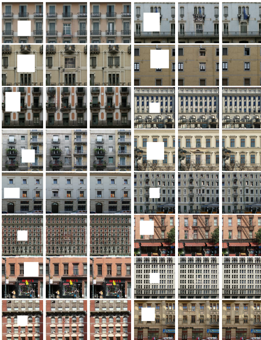
Fig. 13 As shown from left to right in each row, every triad contains the masked input image, the completed result image and the original image. Each input image is sampled and masked from the validation set. Each completed image is directly outputted from the same trained well completion model without any post-processing.